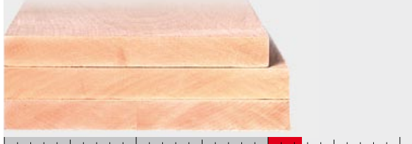
Width range V: 200–224mm