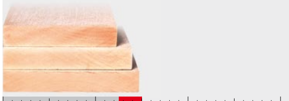
Width range II: 125–149mm