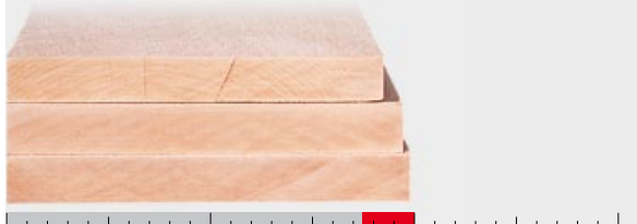
Width range IV: 175–199mm