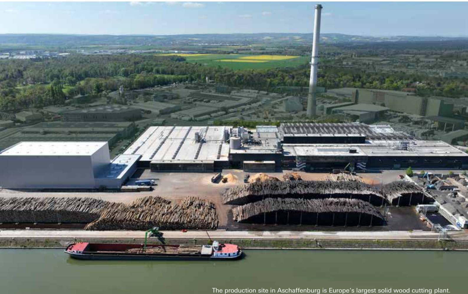
The production site in Aschaffenburg is Europe's largest solid wood cutting plant.

Please contact us. We are happy to support you in reducing your material costs.