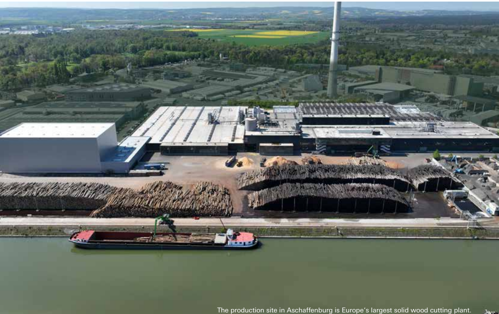
The production site in Aschaffenburg is Europe's largest solid wood cutting plant.

Please contact us. We are happy to support you in reducing your material costs.