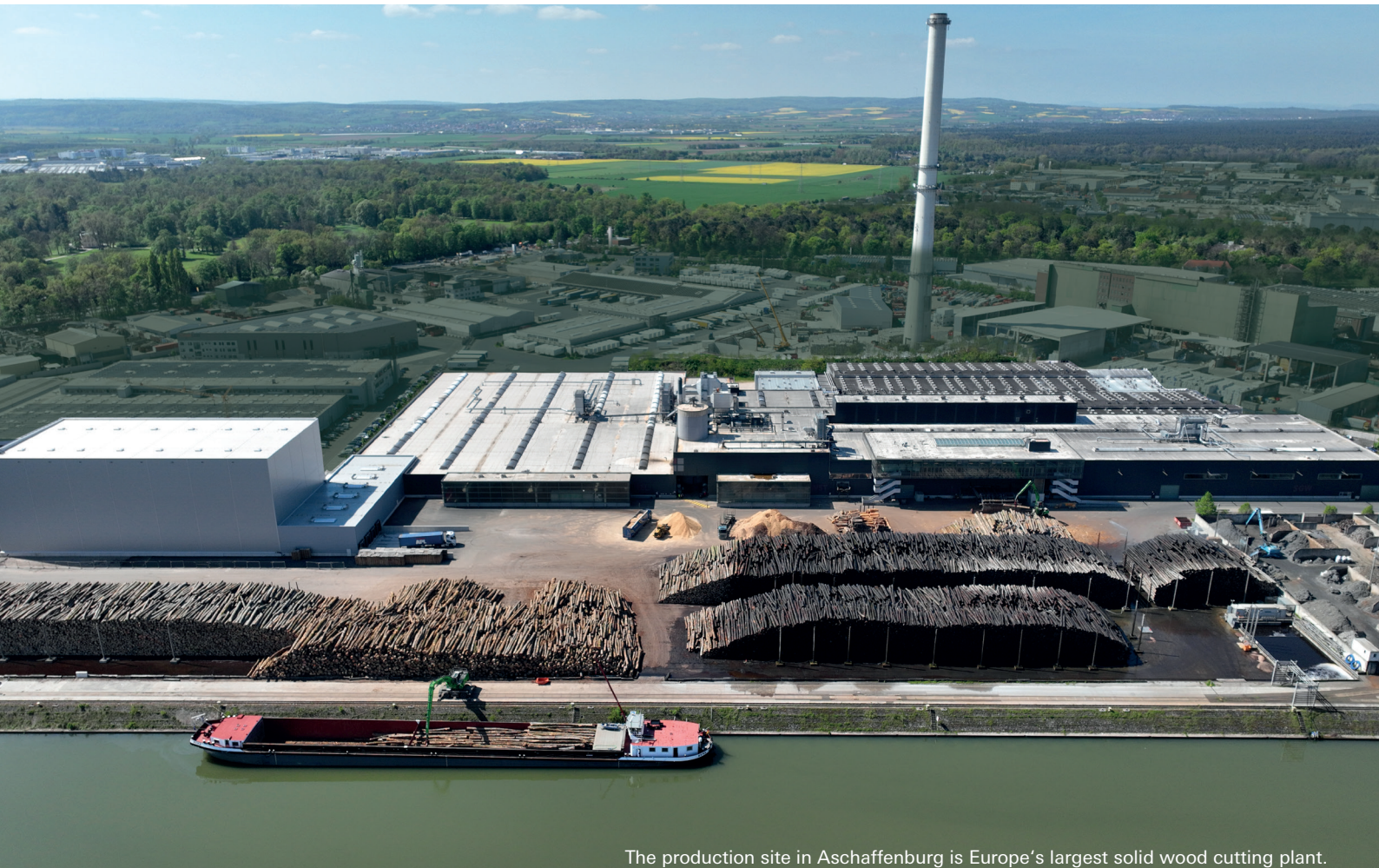
The production site in Aschaffenburg is Europe's largest solid wood cutting plant.

Please contact us. We are happy to support you in reducing your material costs.